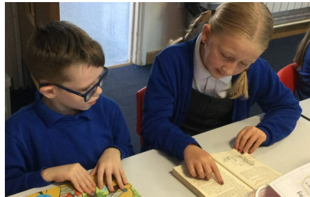
Year 6 and Year 3 reading buddies