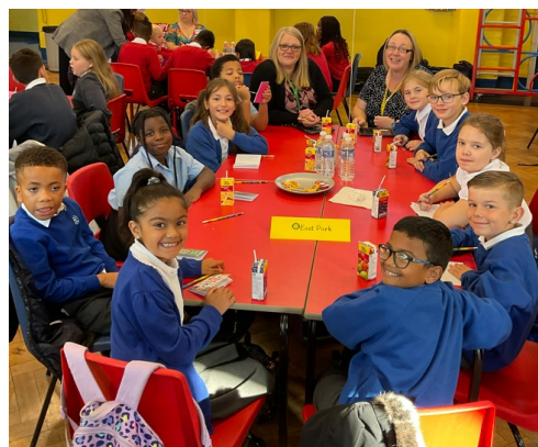
Our East Park Happiness gurus attending a special day at Manor Primary School